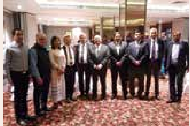
H.E. Mrs. Fazila Jeewa Daareewoo, Vice President, Mauritius with CMD, Director Finance and senior RITES officials

Mumbai - Chennai route (1300 km) and Final Location Survey and GT Investigations for Mumbai - Ahmedabad route for National High Speed Railway Corporation. In order to expedite field work for topographic data collection Airborne LiDAR surveying technology has been used to facilitate the survey of the 508km corridor.