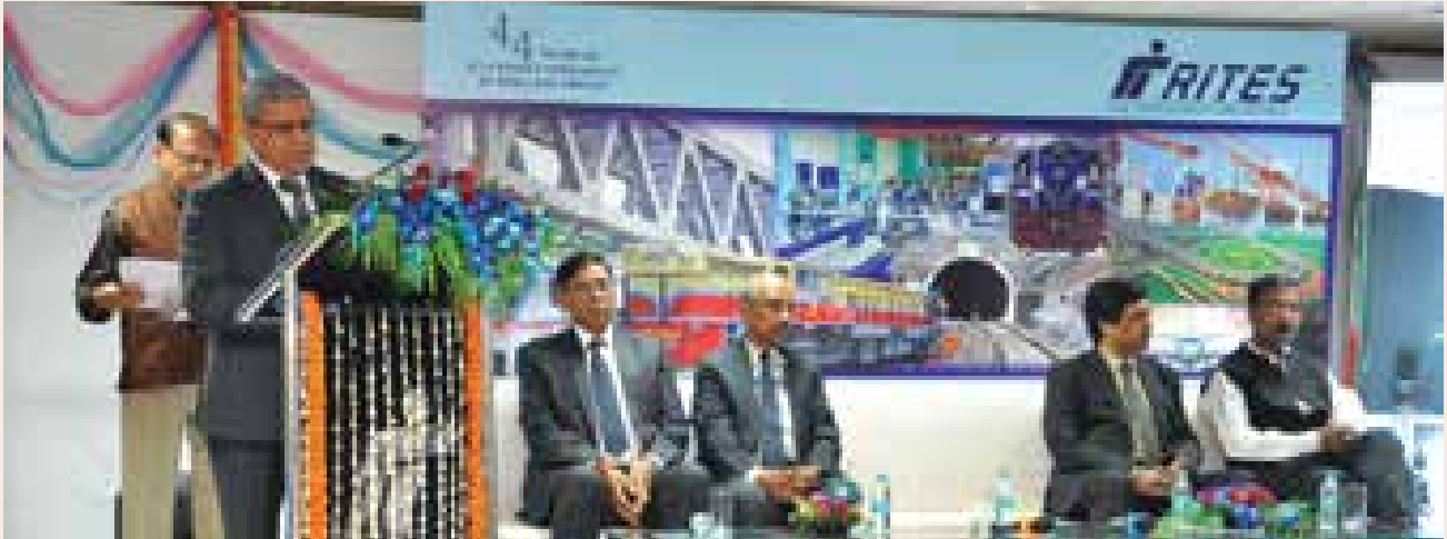
CMD addressing the employees and the guests at RITES Annual Day

compliances through appropriate programs/workshops to comply with statutory obligations. Employee physical and financial wellness programs covering stress management, lifestyle diseases and financial planning were among the other awareness programs organized during the year.