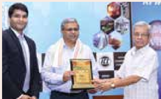
CMD (RITES) was felicitated by the Indian Chamber of Commerce for his leadership and contribution in the field of transport, infrastructure & related technologies consultancy at the 7th Conclave on India Public Sector in New Delhi.

The Comptroller & Auditor General of India appointed the following as Statutory and Branch Auditors for the year 2017-18.