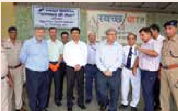
Swachh Bharat Abhiyan campaign

The CSR projects / activities taken up by RITES are in accordance with the sectors as defined in the Schedule VII of Companies Act, 2013. Key projects taken up during the financial year 2017-18 are as