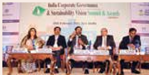
CMD in panel discussion at India Corporate Governance and Sustainability Vision Summit

RITES have an effective internal control and audit systems for maintaining efficiency of operations and compliances of applicable laws and regulations. The organization has well structured policies and guidelines which are well-documented with pre-defined authorities. Detailed Manual is in place to guide and strengthen the internal checks and controls. Regular and exhaustive internal audits are being conducted by experienced firms of Chartered Accountants, appointed by the Management and in-house internal audit team headed by a qualified and experienced professional. The internal control and audit systems are being reviewed periodically by the Management and the Audit Committee. Corrective measures, whenever necessary are being taken up from time to time as a part of continuous improvement system.