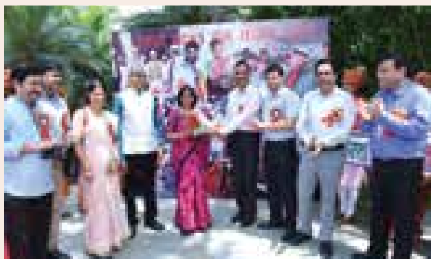
Exhibition & Cultural events on "Sankalp Se Siddhi: Naya Bharat Hum Kar Ke Rahenge (New India We Resolve to Make)" organised by RITES Ltd at Nagpur from 06-10 Sep 2017. The Exhibition was inaugurated by Hon'ble Mayor of Nagpur Ms Nanda Jichkar in august presence of Hon'ble MP Dr Vikas Mahatme.