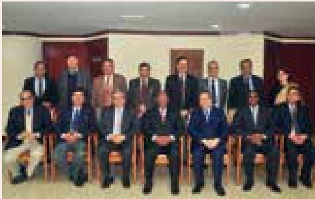
H.E Eng. Carlos Mesquita, Honourable Minister of Transport & Communications, Republic of Mozambique with RITES CMD, Functional Directors and senior officials at RITES office

During the year, RITES has undertaken the work of providing technical consultancy to M/s BEML for Static and Fatigue Testing of the Bogie Frame. These tests conducted as per International European UIC standards. These tests are mandatory for newly designed Bogie Frame or any Bogie Frame being manufactured by a new manufacturer. The real challenge was to ensure the point of application of loads and their direction that would emulate the forces the way they would occur in field under actual operation/usage. RITES has now proven experience for testing of Bogies as per International Standards.