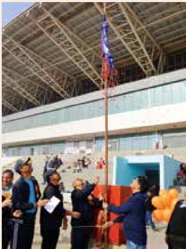
RITES Sports Day

A provision for submission of RTI applications/ First Appeals online coupled with payment of application/additional fees through internet banking, debit/credit cards and RuPay cards, has been provided on RITES website, which enabled the citizens to file their applications/first appeals with ease and receive information faster, cutting on the cost of postal dispatch and time of postal transit.