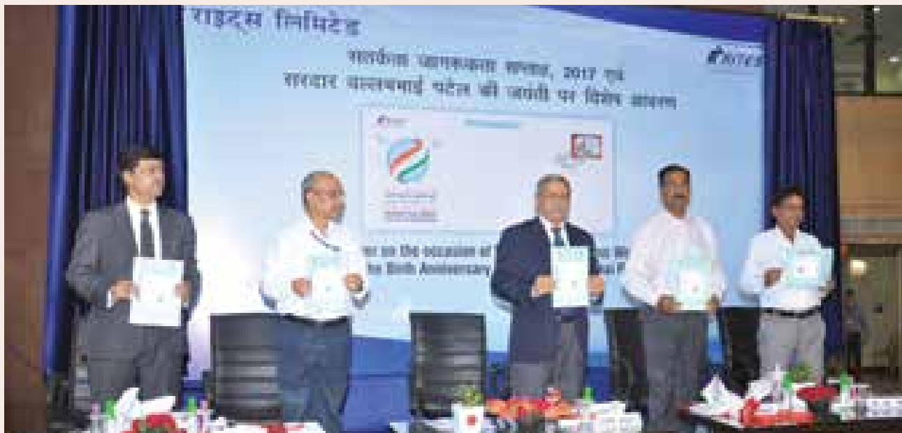
Release of a Special booklet on 'Case Studies' in the presence of CMD RITES, Functional Directors and the Chief Vigilance Officer