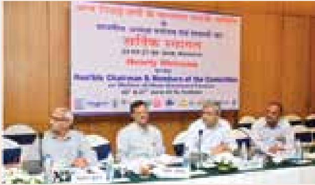
Parliamentary Committee (OBC) at Kolkata with CMD/RITES and its officials