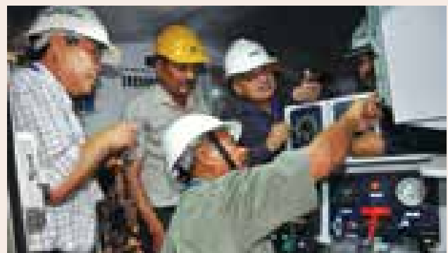
Inspection of locos supplied by RITES at DLW, Varanasi by Myanmar Railways' team

Also, RITES is empanelled with BEE as a Grade -I Energy Service Company (ESCO). This grading indicates "Very High" ability of RITES to carry out energy efficiency audits and implement the energy saving projects in ESCO Mode.