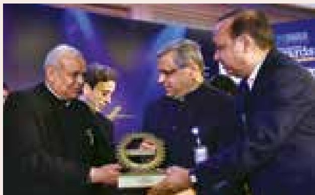
Shri Rajeev Mehrotra, CMD (RITES) received Export Excellence award from Shri Satya Dev Pachauri, Hon'ble Minister of MSME & Export Promotion, (UP) in Engineering Services, large enterprises category from EEPC India Northern Region,