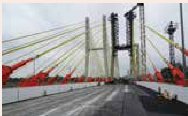
Engineering the design and construction of Six Lane Cable Stayed Bridge along with Approaches near Santra Market, Nagpur.jpg

Being a leading consultancy organization in the field of transportation, RITES keeps itself abreast with the latest technology and knowhow not only in the area of the transportation but also in the technology and technological innovation that bring better efficiency and economic benefits to the sector. To achieve this, the company continuously strives to procure and absorb the best and the latest technological innovations in areas of its business by continuously updating its software and knowledge base by sponsoring and encouraging its employees to become members of National/International Institutions for improving their professional standing and