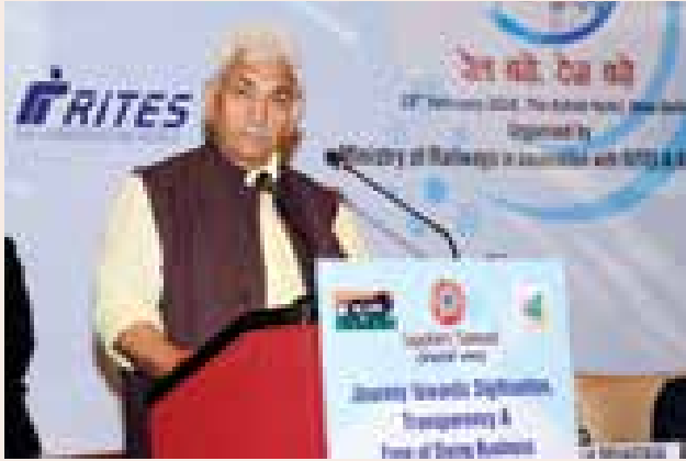
Shri Manoj Sinha, Honourable Minister of State for Railways & Minister of Communication (Independent Charge) speaking at the Suppliers' Samvad function

NTPC, CIL and others at different locations (iv) Construction of Integrated check posts at Birgunj, Jogbani and Biratnagar along Indo-Nepal border, at Dawaki along Indo-Bangladesh border and Moreh along Indo - Myanmar border, detailed engineering for construction of ICP at Sonauli and Rupediah, consultancy services for development of Greenfield international airport at Bhiwadi, Rajasthan and Project Management Consultancy for development of airports at Chitrakoot & Kushinagar, Uttar Pradesh (v) Construction of double line electrified track and related infrastructure for Western Dedicated Freight Corridor (1477 km) for Ph-1, Dadri- JNPT.