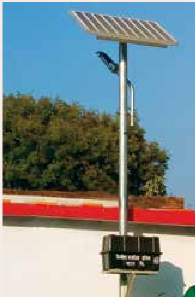
Solar street lighting systems

RITES has installed Solar Street Lighting Systems in villages of Ghazipur, Bhadohi, Shrawasti,