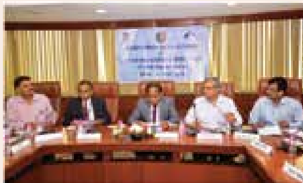
CMD RITES, CMD Wapcos Ltd and other officers in discussion during Town Official Language Implementation Committee meeting

In pursuance of Official Language policy of the Govt. of India (Ministry of Home Affairs, Deptt. of Official Language) and the directions received from Railway Board from time to time, all round efforts