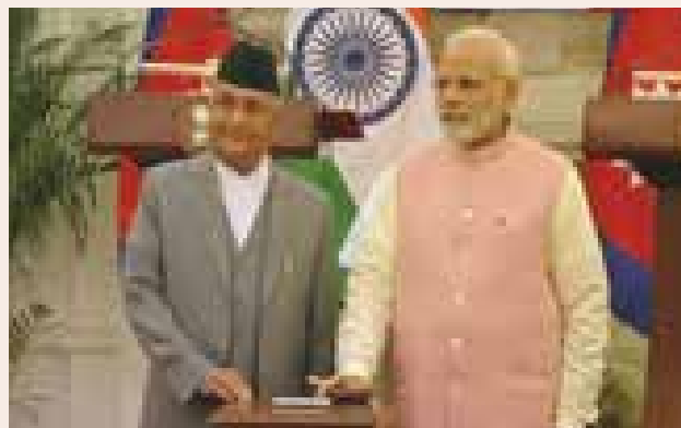
The Integrated Check Post (ICP) at Birgunj, Nepal, implemented by MEA through its PMC consultant M/s RITES, was jointly inaugurated by our Hon. Prime Minister, Shri Narendra Modi and Hon. Prime Minister of Nepal, Shri K.P. Sharma Oli.

During the year, company was engaged in a number of prestigious domestic projects, which included setting up of wagon POH facilities at Bikaner workshop, NWR & at Kurduwadi workshop, C.Rly.; setting up of a new wagon POH factory at Dalmianagar, Bihar; setting up of facilities for Refurbishing of LHB coaches at New Bongaigaon Workshop, N.F. Rly, DPR for Construction of ROB's/ Flyover at 6 locations for DDA, DPR for strategically important roads under Bharatmala scheme in Gujarat and West Bengal and BRT in West Bengal, Design of State of Art Extra - dosed Cable stayed Bridge over River Ganga in West Bengal, Detailed