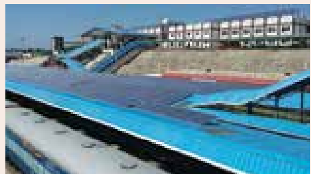
Roof top solar panels at Katra Railway station

During the year, the business of offering shunting locomotives on wet lease including operation & maintenance continued to be well received by domestic Non- Railway clients. The Company has so far leased 41 locomotives to domestic non railway customers. Demand of shunting locomotives on lease by non-railway customers is growing day by