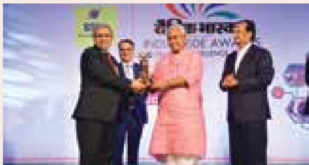
CMD received Dainik Bhaskar Group's initiative India Pride Award 2016-17 in the PSU category of transport sector from Shri Manoj Sinha, Honourable Minister of State for Railways and Minister of Communication (IC).