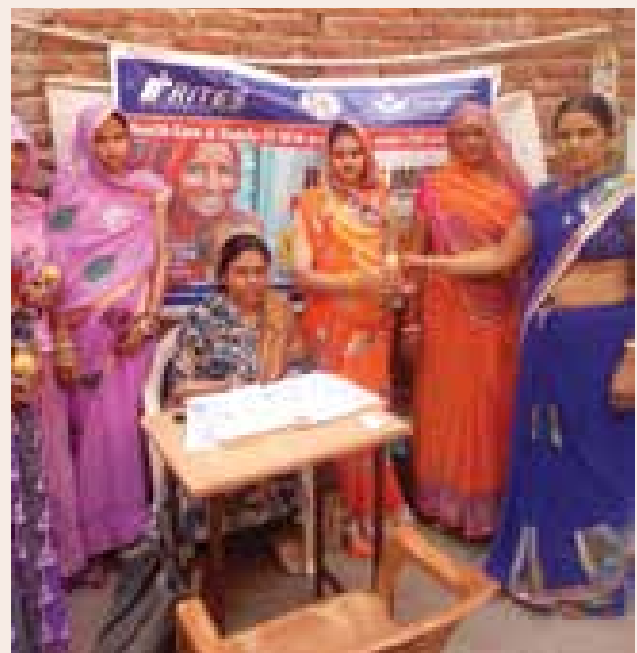
Health check-up and supply of milk products to pregnant women

RITES has set up a Community Toilet at Fazalganj, Kanpur through SULABH International. The