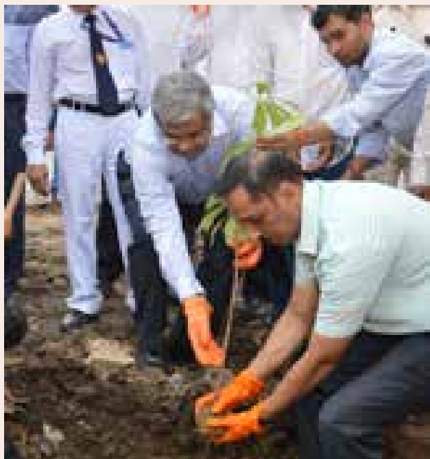
CMD/RITES planting a sapling in support of green initiatives program at RITES office complex

(i.e. ₹ 5.5 per share) which is 55% of paid up share capital of the company. The total dividend payout for the year works out to be ₹ 148 crore which includes ₹ 78 crore final dividend for financial year 2016-17 and ₹ 70 crore interim dividend for the financial year 2017-18.