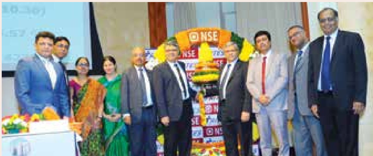
The bell ringing to mark the beginning of trading during company's Listing ceremony on July 02, 2018

day. Apart from wet leasing, company was engaged in maintenance of over 130 diesel locomotives & 1400 wagons owned by customers like NTPC, NSPCL, WBPDC, SAIL & APCPL.