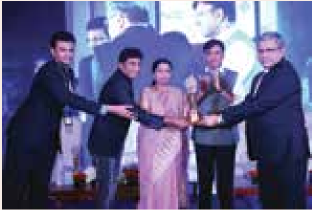
CMD (RITES) received the Governance now PSU Award 2016 for business diversification

the recycled water is used for horticulture. Rain water harvesting system has been installed to recharge the ground water. Reducing carbon footprints is one of the main motives of the Company. REMCL, a subsidiary company of the Company has been working continuously for generating solar energy for Railways. Apart from that the Company has installed roof top solar energy plant to generate to meet its energy requirements. The Company is also socially active in propagating green corridors in the society and has undertaken the maintenance of greenery in the pavements near its corporate office. It also endeavours to impart environmental awareness among the masses.