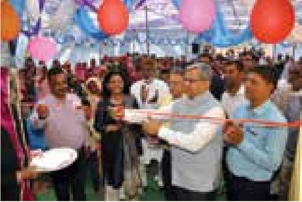
CMD RITES inaugurating the Skill Development and Vocational Training Centre at Mewat, Haryana