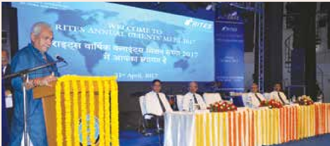
Shri Manoj Sinha, Honourable Minister of State for Railways and Minister of Communication (IC) addressing the gathering at RITES Clients' Meet

Detailed report on observance of Vigilance Awareness Week- 2017 has been sent to CVC. All employees of RITES were also administered the e-pledge on Integrity floated by CVC.