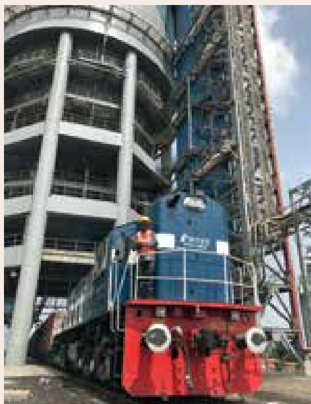
New locomotive WDS commissioned at Adani Dahej project

Railway Energy Management Company limited (REMCL), the subsidiary company of RITES Limited, has successfully commissioned 26 MW windmill in Jaisalmer and has implemented many power procurement contracts for Indian Railways under Open Access policy under the Electricity Act, 2003, resulting in substantial energy savings to Indian Railways.