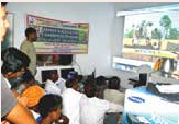
Farmer and Agriculture Awareness Program in Kishangarh Tahsil, Ajmer (Rajasthan)

The objective is to create awareness about Govt. Policies for farmers, welfare measures announced from time to time, newer trends in agricultural reforms, weather forecasts, Implementation of Kisaan Beema, etc., use of computers and Internet, and encouraging the farmers for Saving Habits, etc among farmers of villages in Kishangarh Tahsil of District Ajmer, Rajasthan.